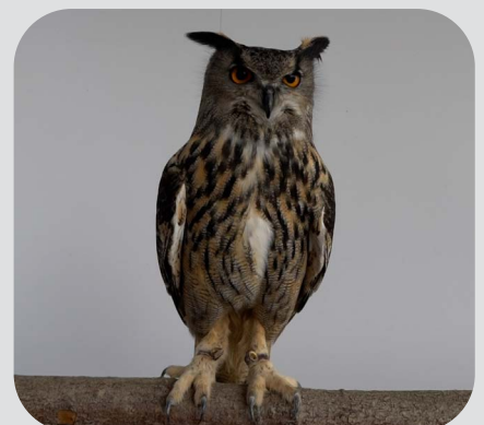
European Eagle Owl