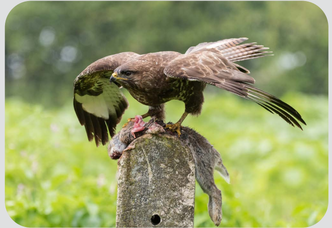
Common Buzzard mantling its prey

The undigested parts are compressed into a pellet , and then coughed up by the owl. Because owls don't chew their food, many of the bones remain whole. We can use these to work out what kinds of prey an owl eats.