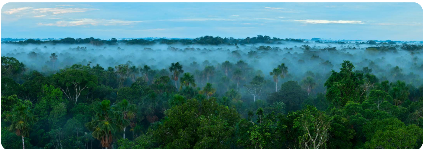
Sunrise in the rainforest. Amazon forest.

Rainforests are the source of many useful products, some examples of which are given below, including foods like bananas, chocolate, coffee and cinnamon. Around 25% of medicines also have their origins in the rainforest, including quinine, one of the first drugs used to treat malaria , which is derived from the bark of the cinchona tree. ACE inhibitors, which are used by millions of people globally to treat hypertension (high blood pressure), were discovered by studying the venom of an Amazonian species of viper.