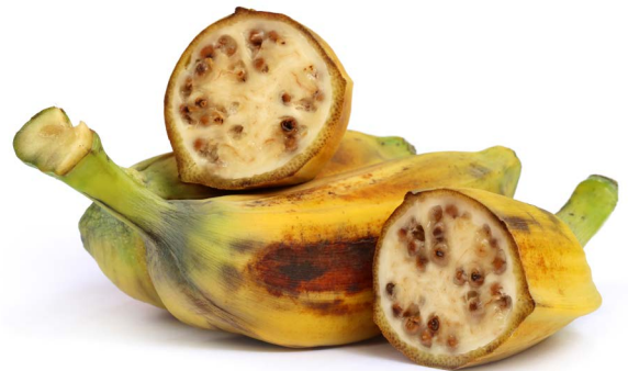
Wild bananas don't contain much flesh and are full of seeds.

Bananas originate from rainforests in southeast Asia (e.g. Malaysia and The Philippines). Wild bananas are very small and full of seeds, whereas cultivated bananas are large and fleshy and have no seeds. This is a result of an event that occurred during their cultivation, believed to have happened around 8000 years ago.