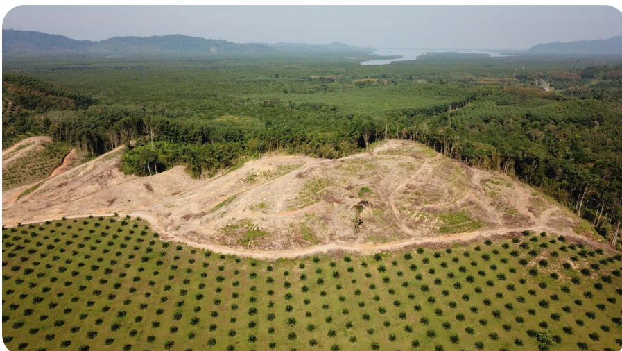
Oil palm plantation. Aerial photo of environmental damage in Southeast Asia.

African rainforests are being deforested at a rate of 0.3% every year. It is believed that destruction of rainforests in Africa might have caused the Ebola epidemic in 2014, as the species of bats which naturally carries the disease came into close proximity with humans after losing its rainforest habitat.